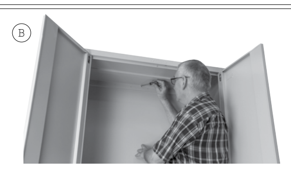
Fasten to the Back Panel with 3 x screws. Then, use a screwdriver to push the 'push-through' slots shown at 'A' into the Front Panel.