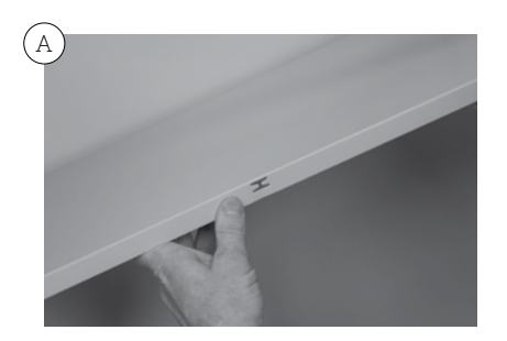
Locate the Top Panel - the front has the 'push-through' slots. Lift the Top Panel into place from the inside