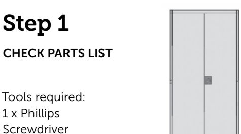
1 x Rubber Mallet 1 x Front Panel (Doors & Frame)