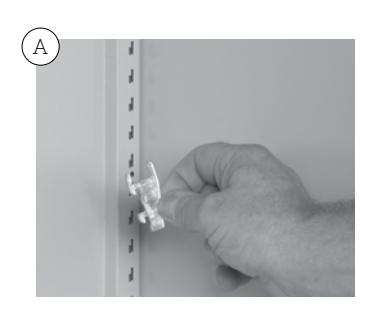
Turn the cabinet upright and place the Shelf Supports into the side rails of the cabinet - 4 per shelf at the same height.