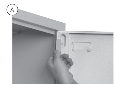
The doors have a spring loaded hinge to allow removal at any time. A cover is supplied for these access points. Simply push into place.