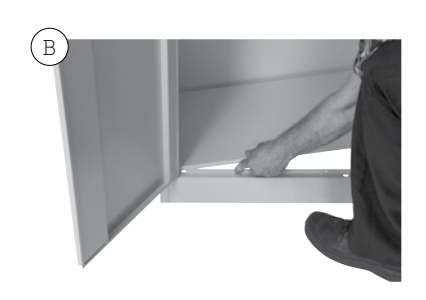
Ensure the front lip goes over the top of the Front Panel.