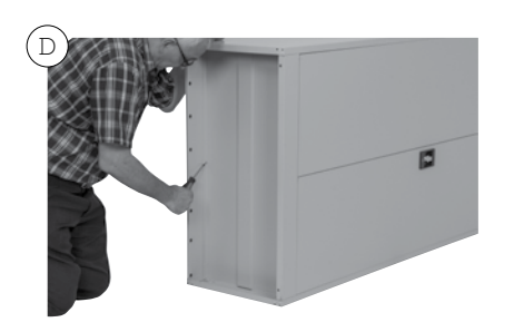
Turn the cabinet onto its side and fasten the Floor Panel with 3 x screws.