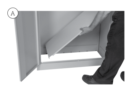
Place the Floor Panel into position with the cutouts facing the front.