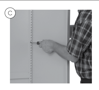
Secure with screws to hold side and rear together.