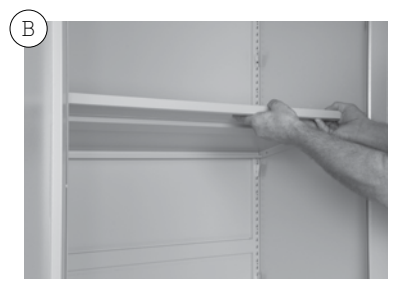
Place the Shelves onto the supports and ensure that they are locked into place.