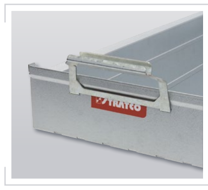
Detachable Tray Handles