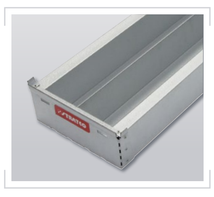
Custom Made Sizes